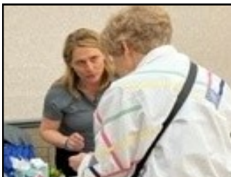
YMCA Healthy Living Center Annual Health Fair